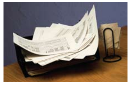
Warehouse, manufacturing, and order fullfillment.

For the past several years, global economic stressors including changes in duty and exchange rates, increased labor costs and increases in materials prices have all had a profound impact on the promotional