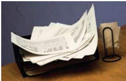
Warehouse, manufacturing, and order fulfillment.

For the past several years, global economic stressors including changes in duty and exchange rates, increased labor costs and increases in materials prices have all had a profound impact on the promotional